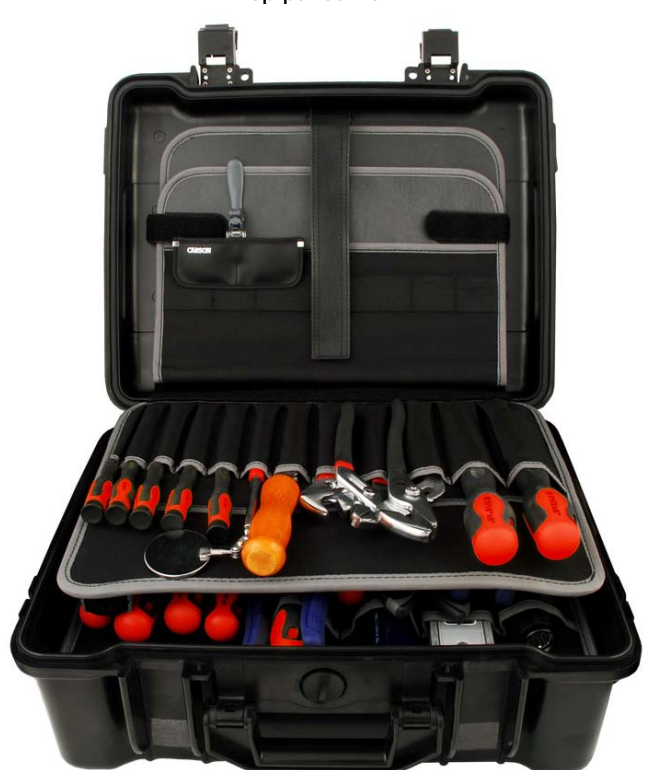
Top pallet view: