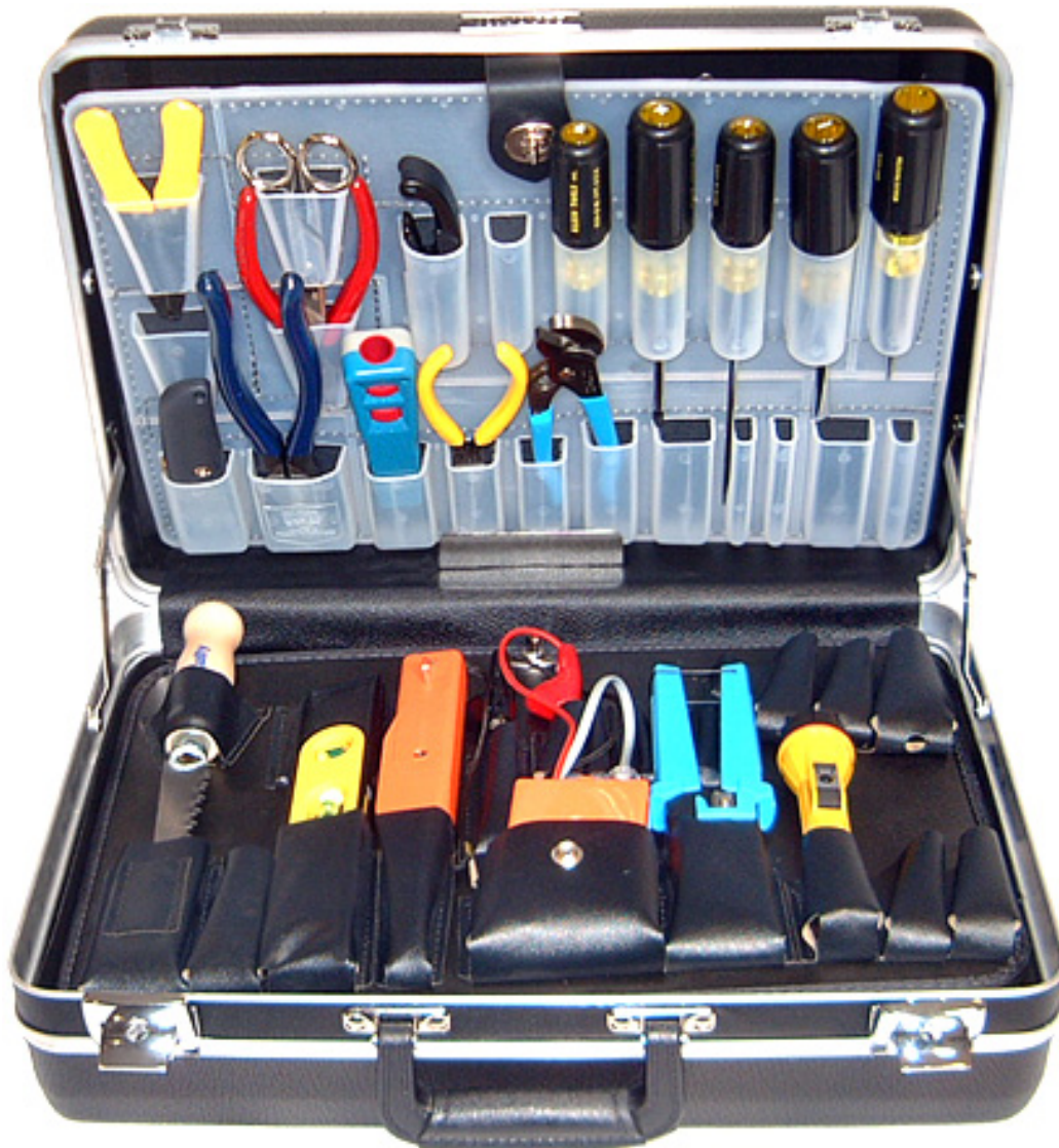
Shown in the 600T-CO Case

For those who prefer an attache style hard tool case we offer the "Technician" tool kit. Start with your choice of a 6" or 8" deep case (600T-CO or 928T-CO respectively). For the upper position we choose the "C" molded pallet and the "O" sewn pallet for the lower. These two pallets are the best combination for the tools that are included (or optional). Unlike our competitors who stuff every cavity with a tool regardless of weather or not it is useful, we sell the kit only with what we believe are the best installation tools and leave some cavities open for future expansion. Many options are available for this kit which will make the installation smoother and the installer more professional and efficient.